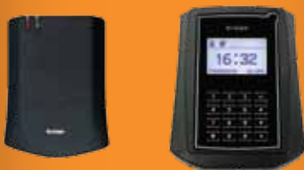
Plato DesFire Readers