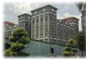
Management & R&D Centre