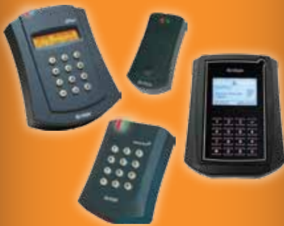
XP-M1000X, XP-SR1000, XP-GTR1500L