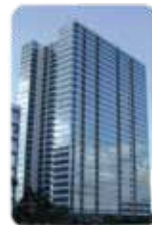
Sales & Service Office Singapore