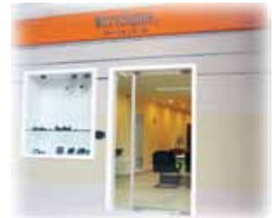
Sales & Service Center